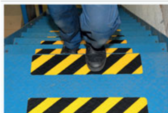
Conformable safety-grip adopts the texture of the durbar or chequer plate. As it is foil based it has no inherent memory so will not lift or rise off.