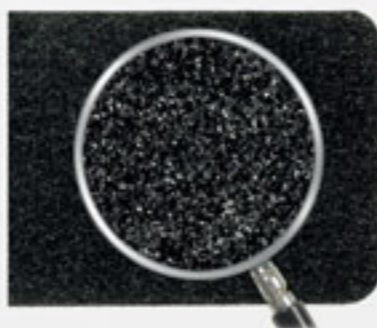
X-coarse is the world's toughest and most durable anti slip tape possessing large mineral pieces.

As a specialist manufacturer our technical knowledge is unsurpassed. We ensure that you receive the correct material in a time scale that is required. Specific samples are easily provided.