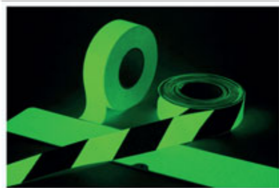
Photoluminescent safety-grip products emit a strong 'glow-in-the-dark' reaction that can illuminate stair nosings, door surrounds, walkways, stairways, skirting boards, entrance/exit ways

Heskins is the world's major producer of self adhesive anti slip material. We produce the widest range aligned with unique versions not available anywhere else. Due to our level of expertise we can provide the best advice along with whatever samples are required.