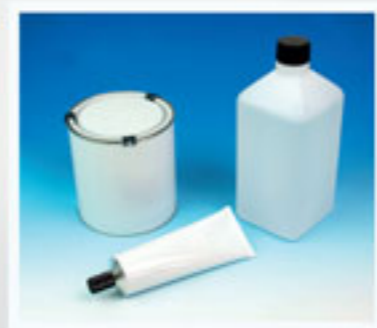
We offer the complete range of ancillaries to help extend the life and make application easy.