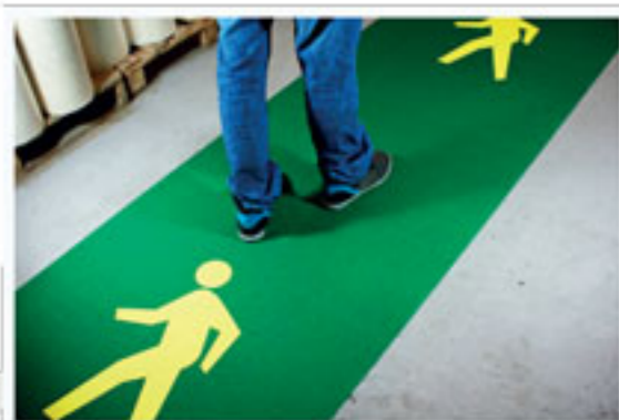
Walkways made from Heskins anti-slip materials aid wayfinding as well as reducing the risk of injury from slipping.